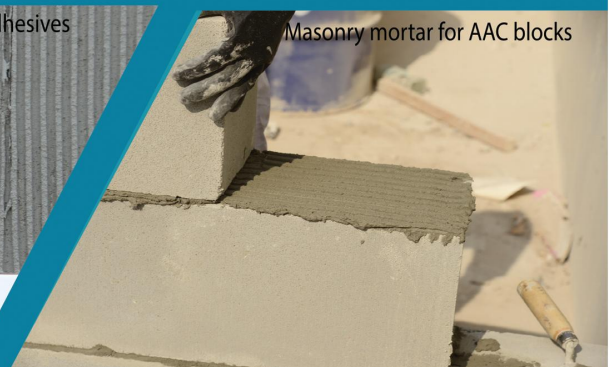
Masonry mortar for AAC blocks